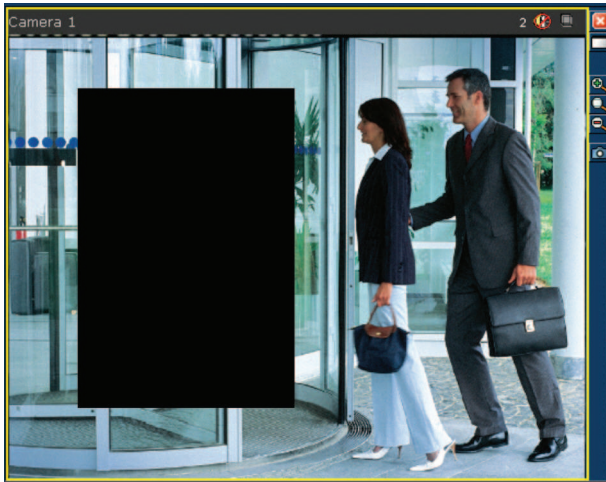
Fig. 2: Area masked by Privacy Zones feature