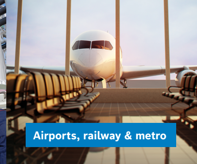
Airports, railway & metro