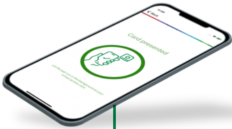
Mobile Access application for smartphones