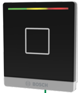
Access control premium readers with BLE (Bluetooth Low Energy)