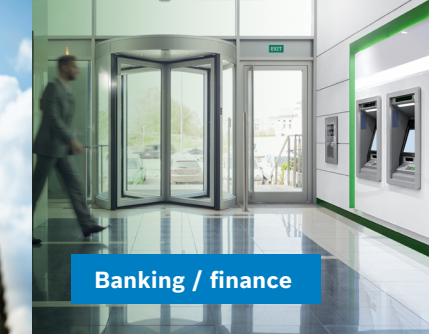
Banking / finance